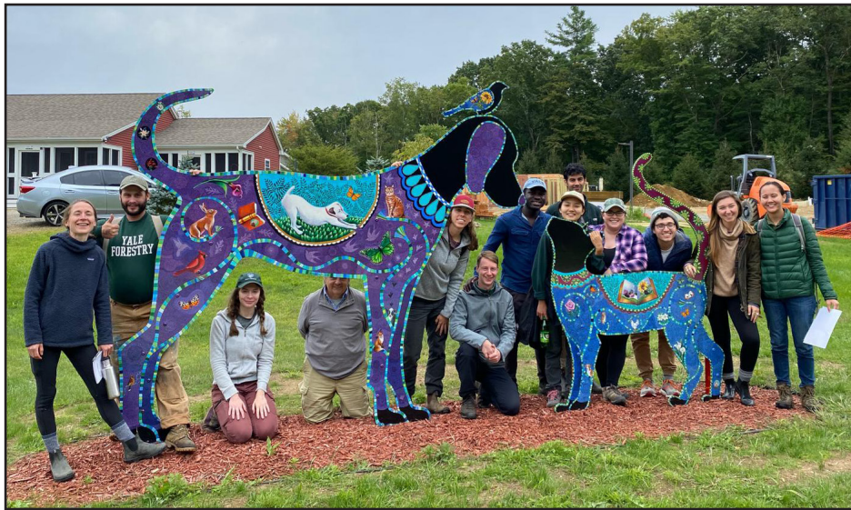
Management Plans students and instructors at one of the six properties that received a plan last fall.

A management plan is a resource that provides an ecological assessment of a property and outlines management actions a landowner can pursue. Last fall, we were one of six student groups that wrote a management plan for a property in Connecticut's Quiet Corner. There