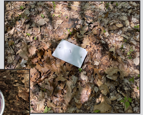
This is what a pitfall trap looks like! The trap with a lid (above), and an exposed trap with the pink reservoir (left).

Next time you walk the Nipmuck or your other favorite trail, try to count how many insects you see , and appreciate them for their contributions to nitrogen cycling and the function of our beautiful eastern temperate forests.