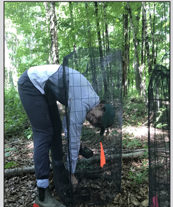
Here I am measuring the soil in the cages that have live beetles for the first experiment.