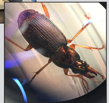
A common forest-dwelling ground beetle (below).