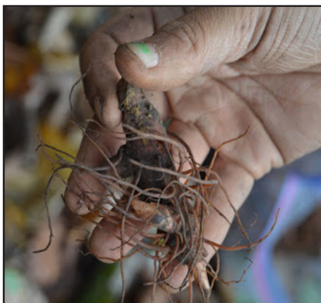
YSE students helped plant germinated ginseng seeds (top) and mature bloodroot (bottom) at the Yale-Myers research plot.