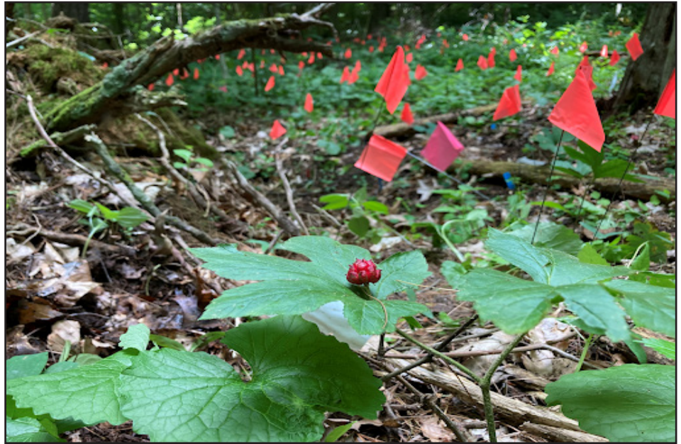
A mature goldenseal ( Hydrastis canadensis ) plant growing at one of the Northeast Forest Farmer's Coalition's research plots.

Walker Cammack, Agroforestry Fellow, MF '22